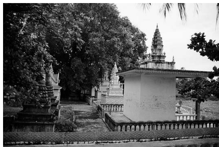
Photo 10 Wat Kokos Votive Stupas

been put into place to receive the pinda . Instead, they were gently placed at either the base of the six spirit shrines lining the platform, or tossed over the three feet high decorative railing surrounding the vihara 's platform. Following the three circumambulations, the liturgical service began inside the sermon hall, a service that lasted roughly half an hour and included the chanting of the Namassaka , the Namotassa , the pancasila (five moral precepts), the Parabhava Sutta , the Tirokudda Sutta and the anumodana . What was done differently at this temple was that the bay ben pradakshina was performed first, and the liturgical chanting followed.