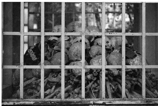
Photo 11 Skulls