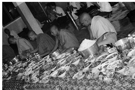
Photo 13 Monks Feast

village pagoda, so we decided to spend the morning at Wat Tralaeng Kaeng in Kompong Chhnang just north of the old capital of Udong.