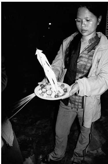
Photo 3 Spirit Flag

mining the symbolic significance of pinda figures heavily in ascertaining the cardinal religious meaning of this entire ritual season. Pchum means “collection” and so pchum ben is the “gathering or collecting/making of pinda .” During kan ben , the ritual of bay ben , or “tossing” the pinda , is performed every morning between 4 and 6 a.m., depending on the ritual schedule of each of the wats .