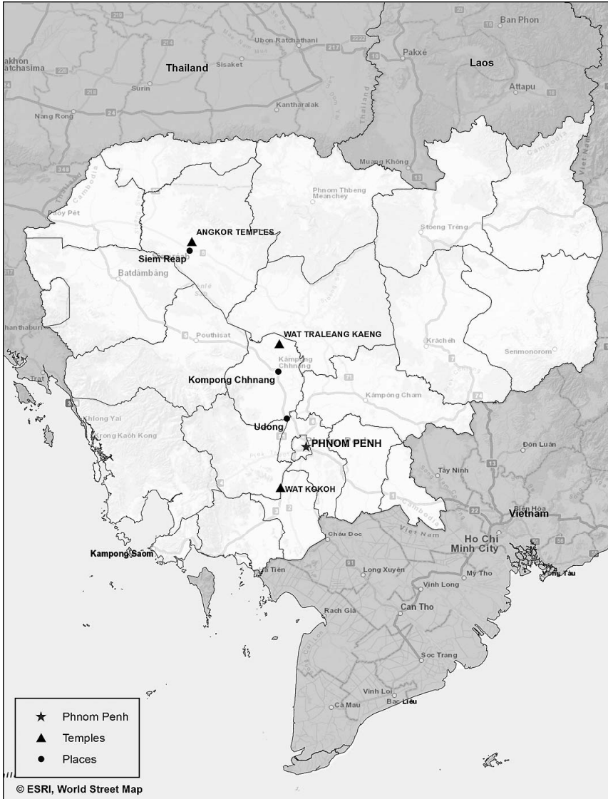
Map 1 Map of Cambodia

acknowledging it ( ibid. , 188) . . . . Their food and gifts do go a long way to help create a sense of solidarity, familial love, and trust, which might otherwise be strained by the tyranny of distance, the length of absence and the gulf in lifestyles. During the two weeks of Bhum Pinda, the direction of wealth is reversed. ( ibid. , 189)