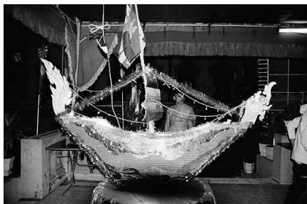
Photo 12 Temple Boat