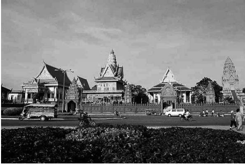
Photo 1 Wat Unnalom