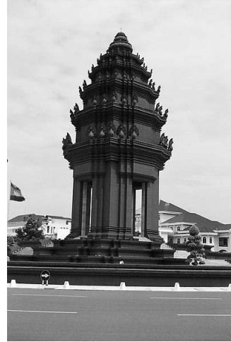
Photo 2 Independence Monument