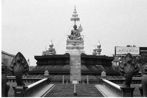
Photo 8 Chuon Nath