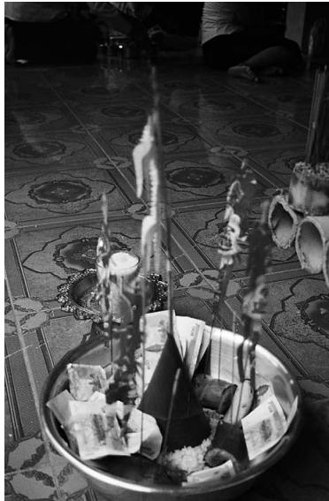
Photo 5 Banana Leaf Wrap

in Khmer culture and society. That is, “Cambodian society, so thoroughly agricultural, finds its dominant image of value and value-creation, in the production, distribution and consumption of food” ( ibid. , 110). The giving of rice, therefore, is symbolic of the giving of life, its nurturance, its sustenance. Rice is life’s vital principle and so the giving of rice to ancestors, which is precisely what occurs during the bay ben of kan ben , is not only symbolic of regenerating the life of the lineage or family, but it also a fundamental mark